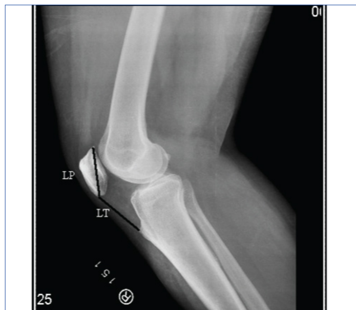
[Table/Fig-1]: Lateral view radiograph of knee joint to measure IS index. LP= Length of patella, LT= Length of ligamentum patellae

On further assessment, to explore a cut off value for clinical measurement it was seen that, a value of 0.98 cm gives sensitivity